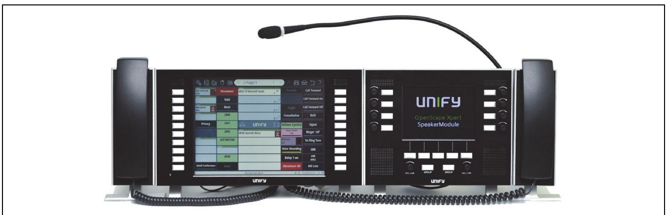
OpenScape Xpert 6010p V1 terminal

To reduce the number of moving parts and increase mean time between failures/replacement, the OpenStage Xpert device uses a compact flash card and is fanless. In addition, all of the components in the solution are compatible with VMware and can be doubled-up for redundancy and high availability.