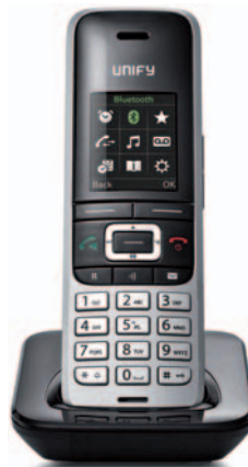
OpenScope DECT Phone S5