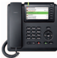
OpenScape Communication Point 600

OpenScape 4000 V8 supports the CP phone family in their SIP and HFA version. OpenScape 4000 can dynamically provide the cPxxx endpoints with the necessary SW (SIP or HFA) depending on the line configuration.