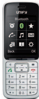
OpenScope DECT Phone SL5