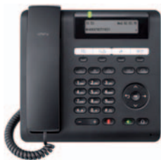
OpenScape Communication Point 200

Also with the new terminals, the customer can use the familiar scope of functionality!