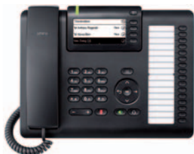
OpenScape Communication Point 400