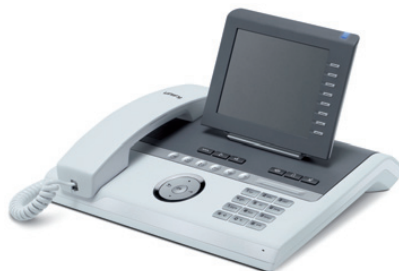
OpenStage 60 T