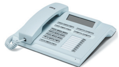
OpenStage 30 T