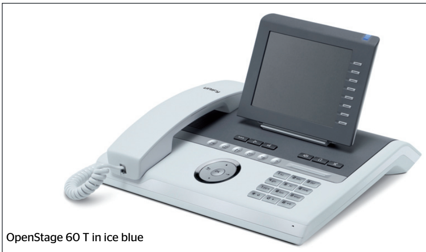
OpenStage 60 T in ice blue

OpenStage 10 T, 15 T and 30 T are downwards compatible and can be operated like optiPoint phones.