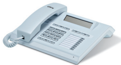
OpenStage 15 T